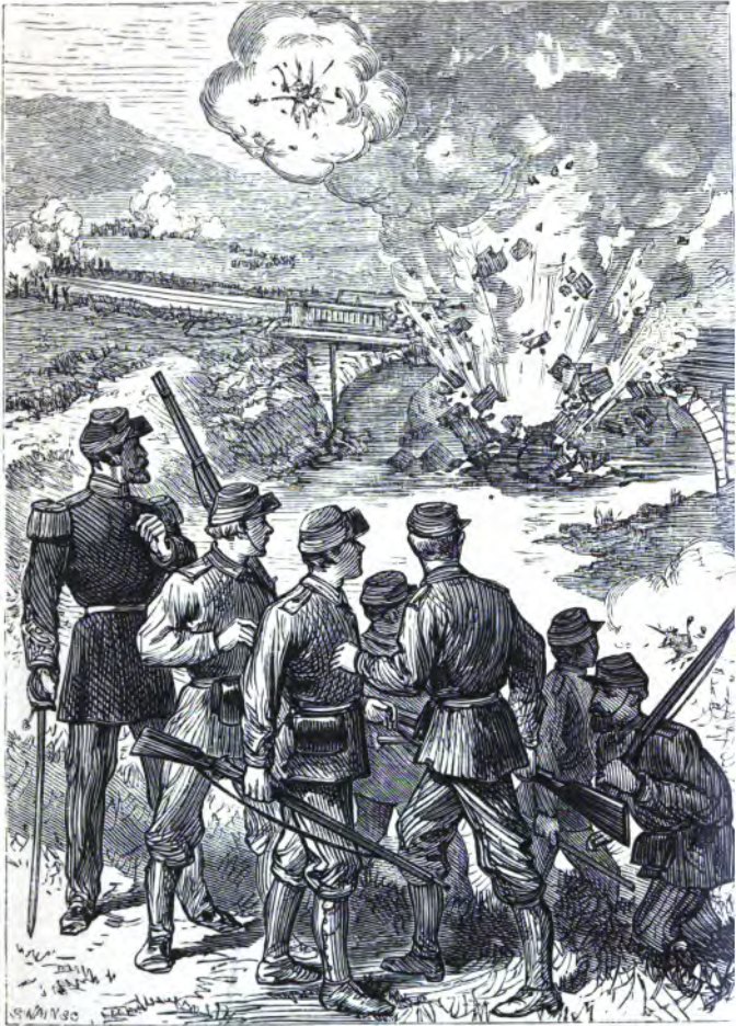
Blowing up the Bridge.—Page 163.